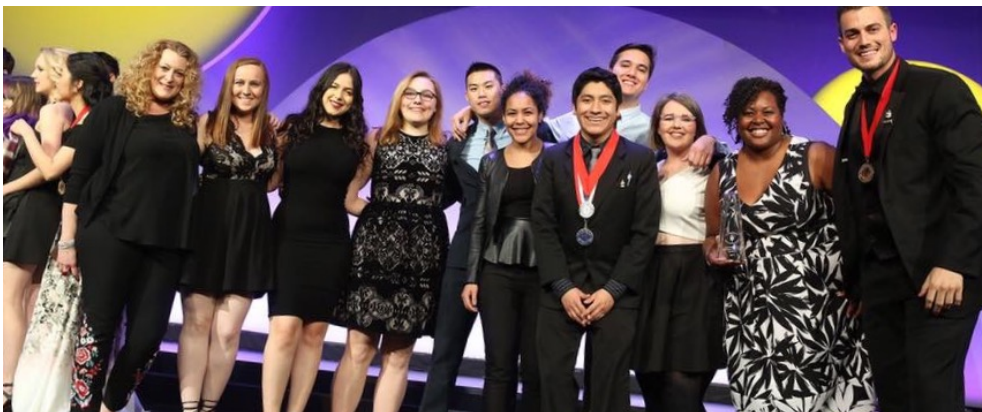
AIO Chapter in April 2017 after receiving an award at Catalyst for their Honors in Action Project.